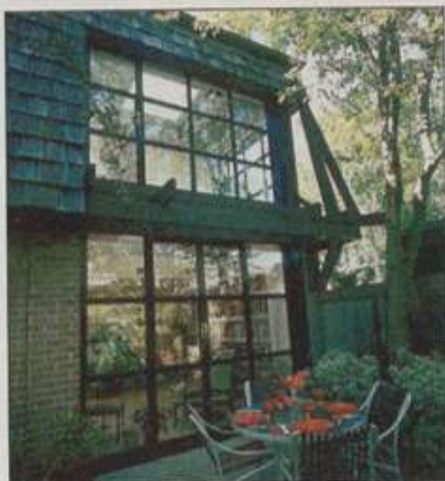
IRON-FRAMED WINDOWS and patio door strike a bold stance.

Before remodeling, the library (above) was a small back porch served by sliding glass doors. To enclose the space, the designer built walls on two sides and wrapped the corner with windows. After beefing up the structure, he removed the walls between the new library and adjacent living areas, making the new room an integral part of the house.