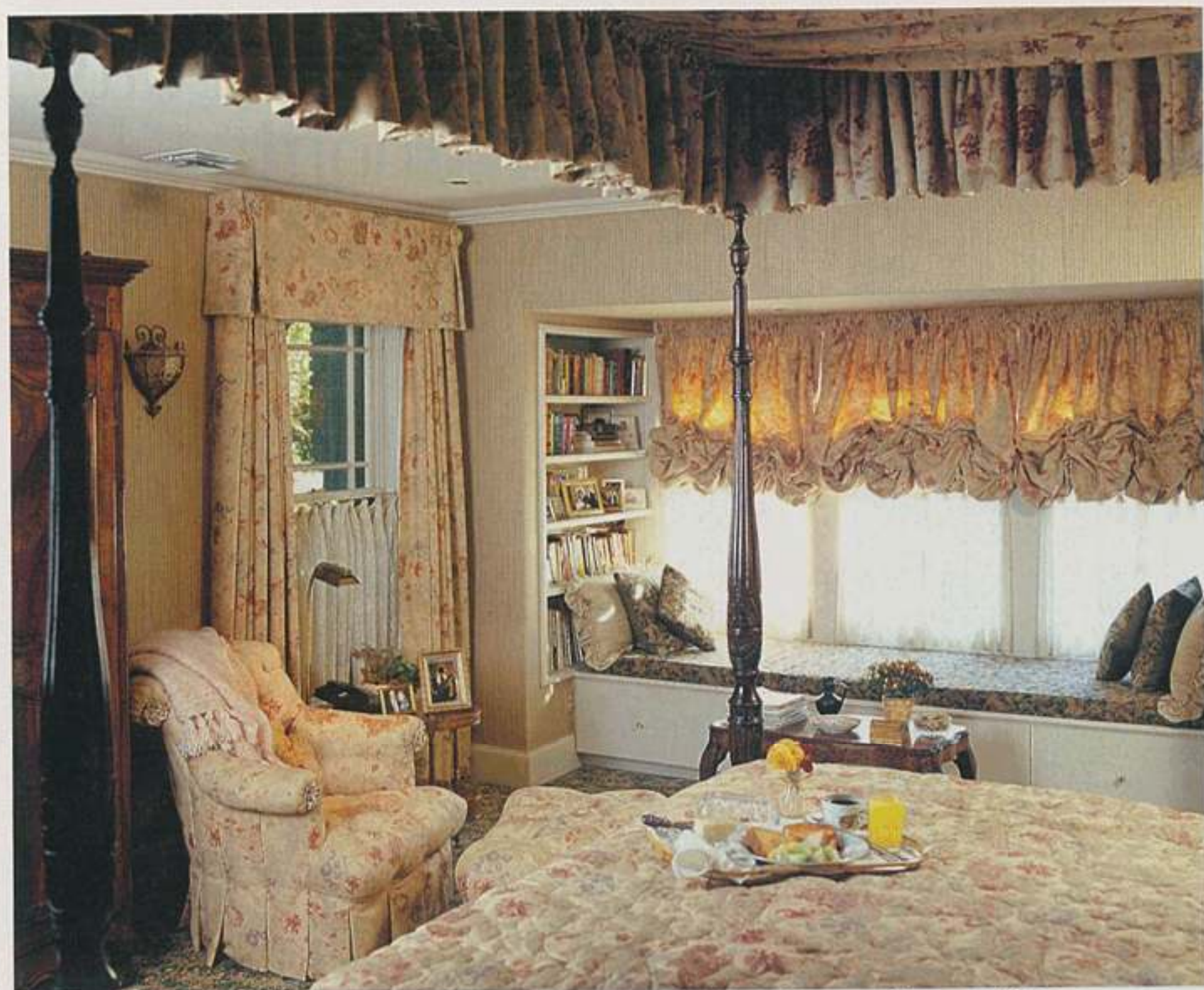
A new bay window adds a few more feet of floorspace, floods the room with natural light, and provides a cozy alcove for bookshelves and seating.